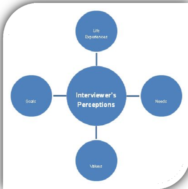
Figure 1: Perception in the Interview

First, we discuss some of the psychological pitfalls of personal interviewing. Second, we look at a company that is experiencing personnel problems. Third, we look at how the problems can be resolved.