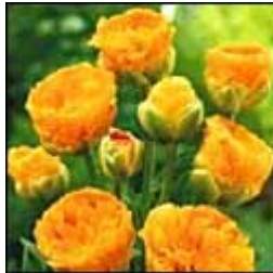
Figure 2. Beauty of Apeldoorn