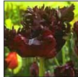
Figure 3. Black Parrot