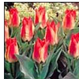
Figure 5. Plaisir

Order your bulbs early enough that they can spend anywhere from 8 to 10 weeks basking in the chill of your frig. Store them in a mesh bag so that they get good air circulation. If you are a fruit lover you may want to strongly consider getting a spare refrigerator – one of the minis so readily available. Fruit gives off ethylene gas – and ethylene gas will kill the flower inside your bulbs.