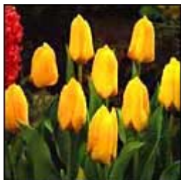
Figure 4. Candela