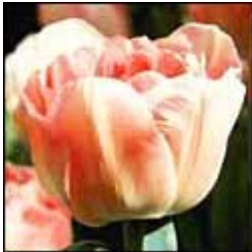
Figure 1. Angelique

Tulips are classified with perennials but often need to be treated as annuals. Dig up your tulip bulbs once the foliage has died & store them in a cool dry area for replanting in the fall. There are a wide variety of tulips, some are shown in the following figures.