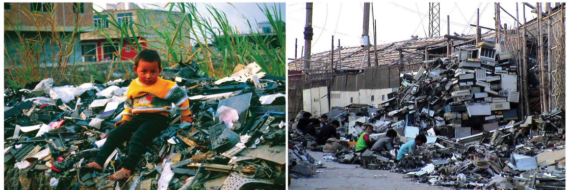
FIGURE 5.5 Photos from Guiyu, China [45]